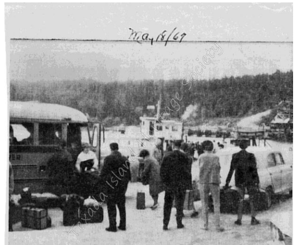
Boarding LAST minute check on suitcases, board the ferry for their trip to Expo. boxes and extras of all kinds is made by the Texada students as they

Peter Lock Texada Island Heritage Society